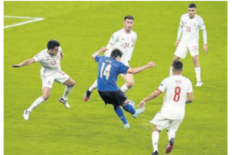
Italy will be back at Wembley Stadium for the final on Sunday against either England or Denmark.